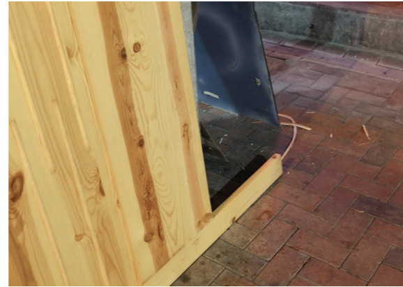
廢棄的床頭；福元街和英皇道交匯處天橋下，20:52 Discarded headboard; under the overpass at Fuk Yuen Street and King's Road, 20:52