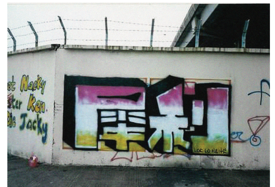
「犀利」，BLOKE成員answer於2000年的油街前政府物料供應處外牆的塗鴉。 "Marvellous", graffiti by answer from BLOKE, located outside the wall of ex-government supplies depot site, Oil Street.