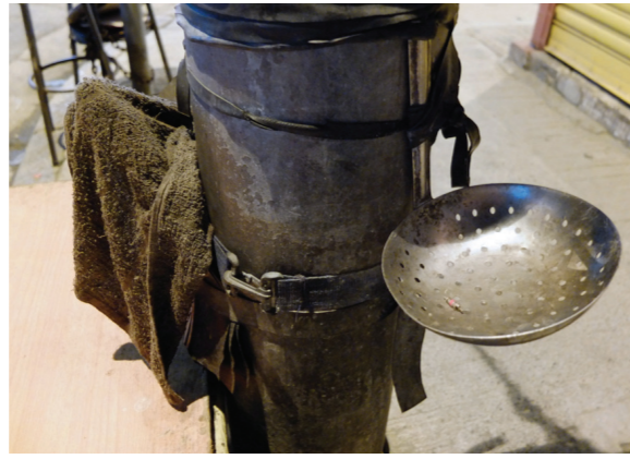
公共服務繫於公共服務，版本一；油街、近宏安道街角的公眾浴缸旁，21:07 Public service tied to public service, version 1; next to public bath on Oil Street at the corner of Wang On Road, 21:07