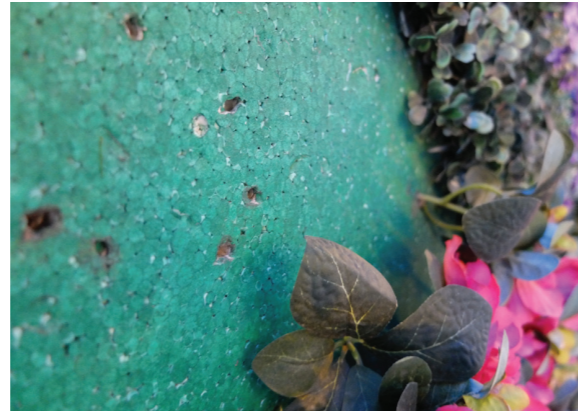
被假綠美化化的地盤，版本二；油街、港島海逸君綽酒店對面，19:27 False greenery to beautify construction site, version 2; Oil Street across from the Harbour Grand Hong Kong Hotel, 19:27