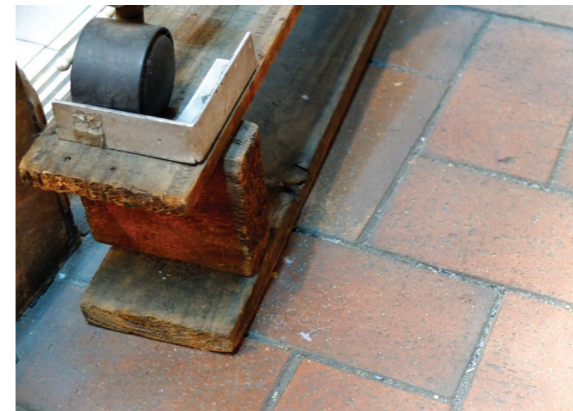
卡板架，於公共空間前所未有的輕型；樂意時裝店門口，20:56 Pallet rack, ever so slightly in public space; Lok Yee fashion boutique storefront, 20:56