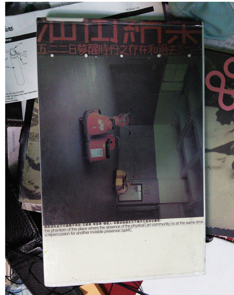
又一山人的攝影集《油街結業：五二二日夢醒時份之存在和過去》。 Before and Ever After. 522 Days of Oil Street , a photobook by another mountainman.