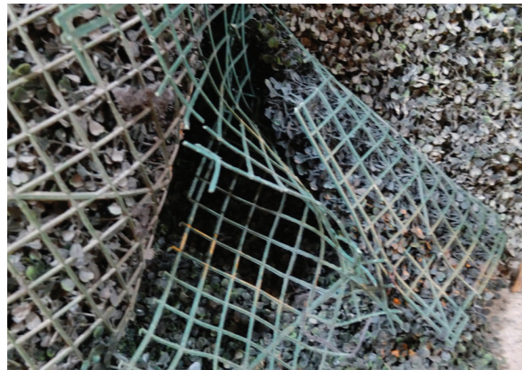
被假綠美化化的地盤，版本一；油街、宏安道與京華道之間，19:35 False greenery to beautify construction site, version 1; Oil Street between Wang On Road and King Wah Road, 19:35