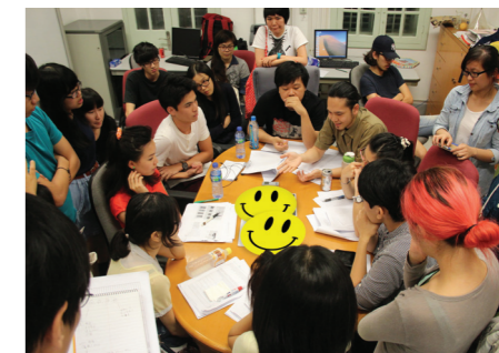
2013年評審進入最後討論階段 Final judgement in 2013