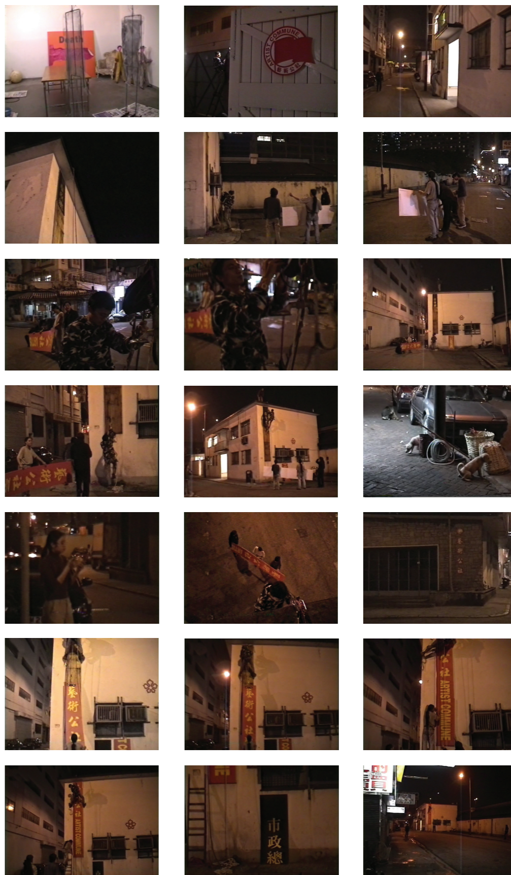
「死在香港」錄象片段 Video stills "Death in HK"