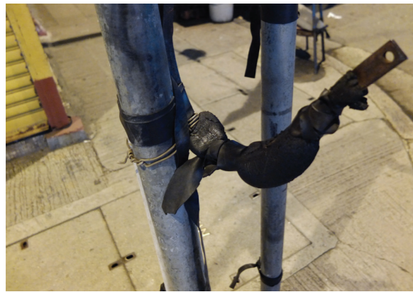
公共服務繫於公共服務，版本二；宏安道、油街轉角，21:08 Public service tied to public service, version 2; Wang On Road at the corner of Oil Street, 21:08