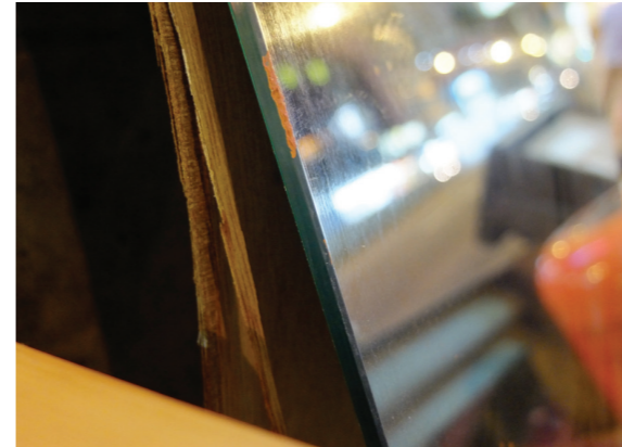
一面廢棄鏡子面向英皇道；福元街和英皇道交匯處天橋下，20:53 Discarded mirror facing King's Road; under the overpass at Fuk Yuen Street and King's Road, 20:53