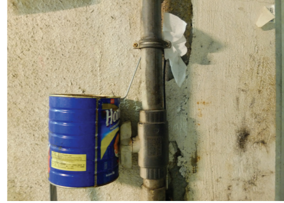
資本主義骨幹裡的公共服務；油街和艇街之間的小巷，21:03 Public service in the backbones of capitalism; alley between Oil Street and Boat Street, 21:03