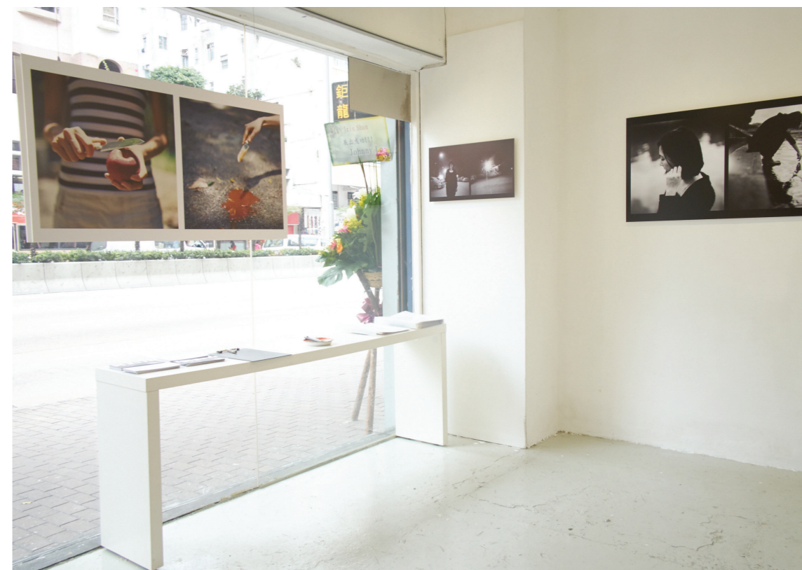
遷往九龍新址後首個展覽《雙》—— 岑倩衡個人展 | 2014年1月 First exhibition at our new space in Kowloon: "Deux" — solo exhibition of Iris Sham | January, 2014