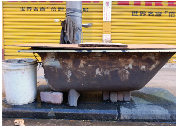
公眾浴缸；油街、宏安道轉角，19:23 Public bath; Oil Street at the corner of Wang On Road, 19:23